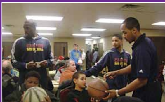
Canton Charge players autograph basketballs for young fans at Refuge of Hope